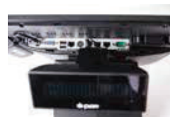
Easy Access to I.O Ports Innovative placement of ports makes it easy to connect and troubleshoot cabling