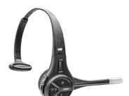
Flexible Design The sturdy design of the headset ensures comfortable fit for all head sizes