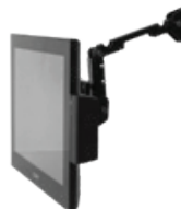
Superior Flexibility Low profile / wall mount