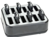
12 Slot Battery Charger Battery life indicator lights and audio messages

Electrical type, Directional/Noise Canceling Headset, Dynamic, Replaceable Earpad, 2.4ghz Operating Frequency, Rechargeable Lithium-Ion Battery (With Short Circuit Protection), LED RGB Indicator, 50m (164ft) Operating Range