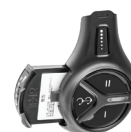
Simple Self-Service Changing batteries, boom foam, & more in a snap