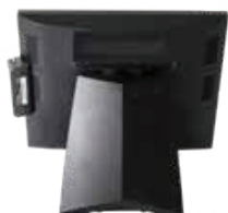
2x20 Customer Display Easy to read display