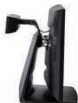
Futureproof Design Pedestal Pods provide more mounting options