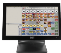
15.6" TFT Display

WEIGHT: Terminal Only: 11.72 lbs • Terminal, Customer Display & Power Brick 13.66 lbs